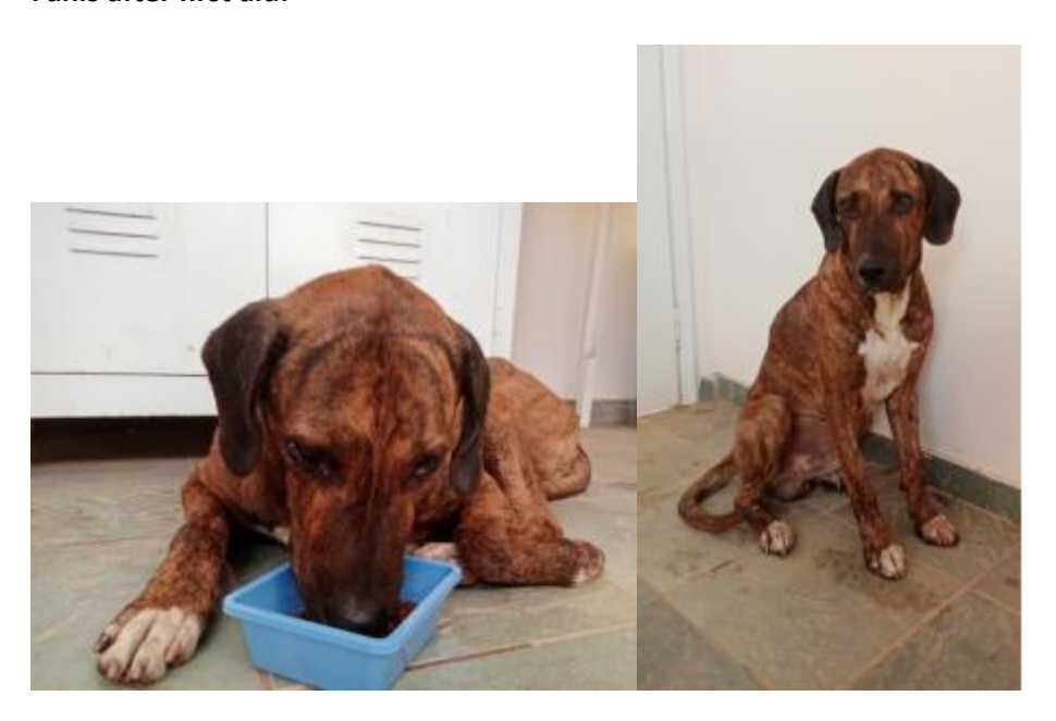
Your Team from Animal Protection